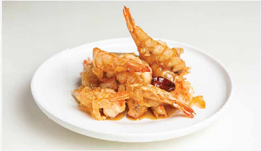
酥皮大明虾 Crispy Shrimp