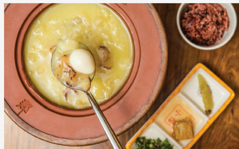
黄坛子 Emperor's/Empress's Jar