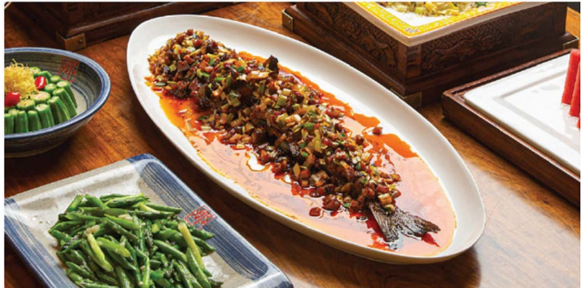
干烧黑鳕鱼 Dry Braised Black Cod Fish with Chili Sauce