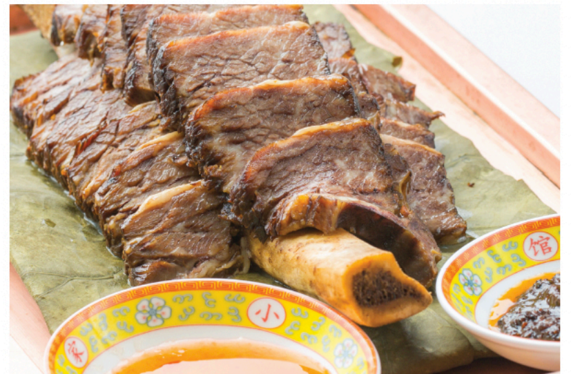
稻香安格斯牛肋 Na's Prime Angus Rib