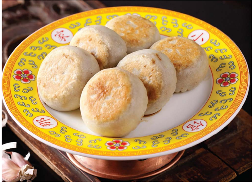
门钉肉饼 Pan Fried Beef Buns