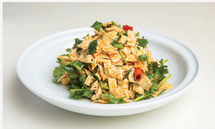
温拌鲜腐竹 Chili Tofu Skin Salad