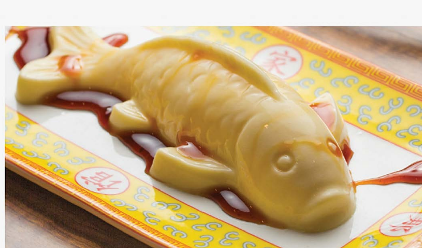
干酪鱼 Cheese Pudding