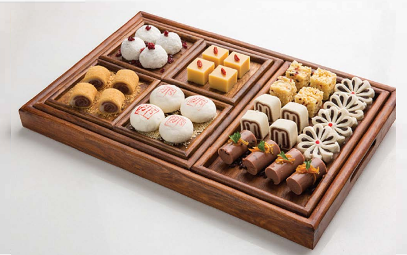
京八件 Na's Assorted Eight